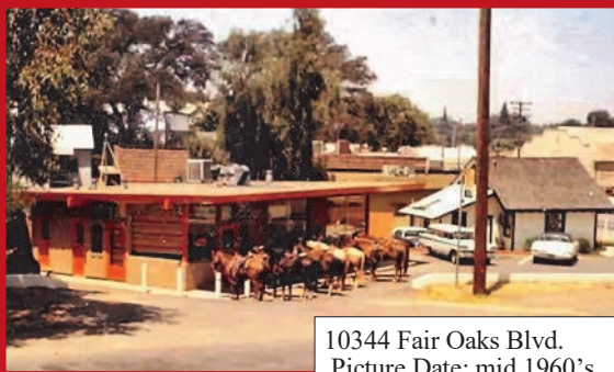
10344 Fair Oaks Blvd. Picture Date: mid 1960's

Yes, that is the building that became our History Center at the right side of the drive-in, looking Northwest from an embankment.