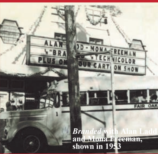
Branded with Alan Ladd and Mona Freeman, shown in 1953

Other names mentioned prior to being the Sunflower Drive-in (1977) were DJ Drive-in (1961-1963), Poor Old Nick's (1963-1965), and Susie Q (1965-1977).