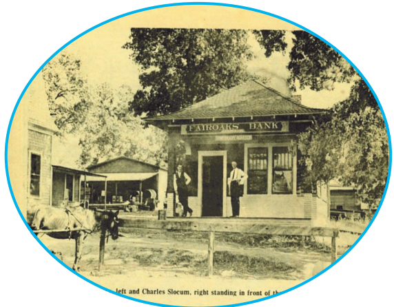
left and Charles Slocum, right standing in front of it

The first bank was located at the site where the present Fair Oaks Library is now on Grand Ave. About two years later, a fire destroyed that building. The temporary bank building, shown here that also burned, was located on California Ave. south of Plaza Park, where the real estate office is today.