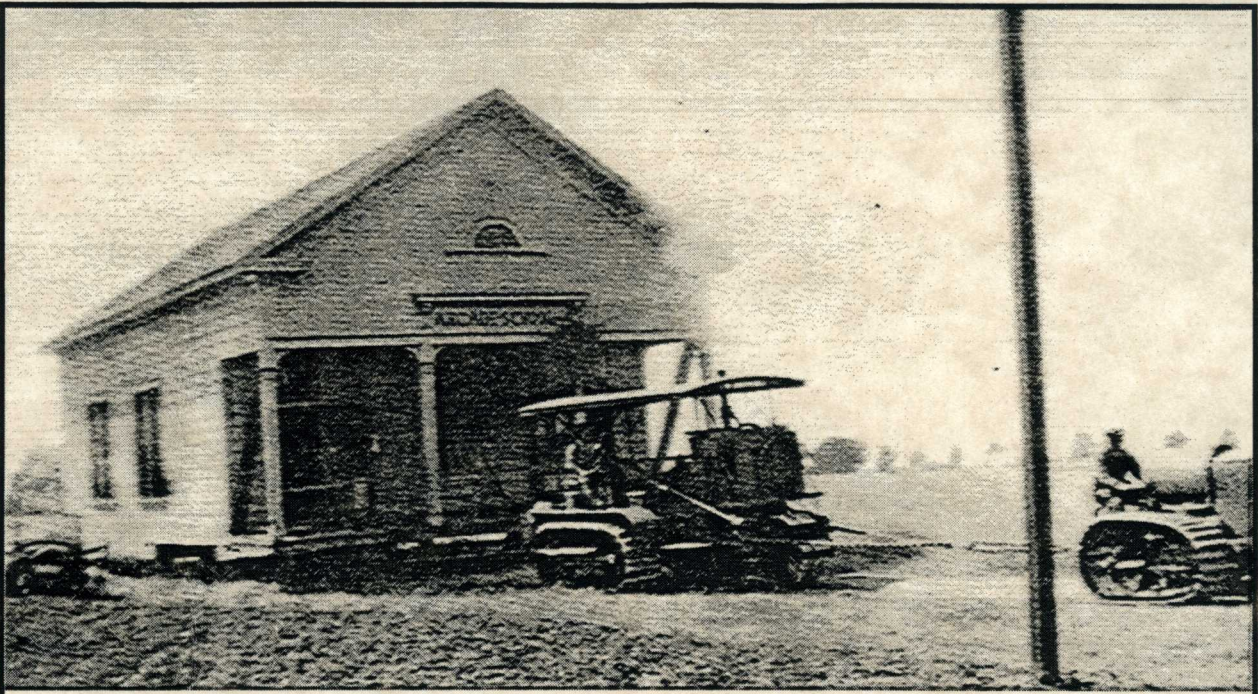
Moving the Arcade School Building from Fulton to Edison and Watt ...1922