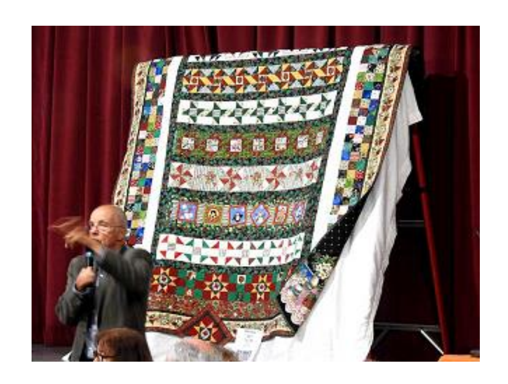
More Pictures from Soup Night 2018