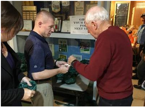
Photo Highlights from Soup Night 2016