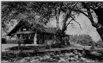
"Rowan Brae"—See Description Above

61-10 a., paved hwy.; 4 r. house, big porch; about 275 trees; $8,000; terms.