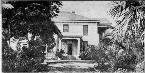
"Miramont"—A Beautiful Colonial Fair Oaks Home (No. 53)

Such a condition—it seems needless to say it—never existed, in California or anywhere else. It is true that a family can exist, with perhaps less effort, and certainly with less discomfort, in California than in most sections