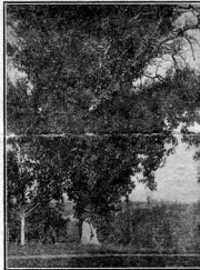
Oak Tree and Ivy

34-3 a., with modern 6 r. house, barn and