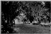
Cozy Nook on a Small Ranch

of the country; but it is equally true, that in order to succeed it is necessary to have some money, and to use at least ordinary diligence and "horse" sense. It is also true, that nowhere else will Nature respond so quickly and so bountifully, if